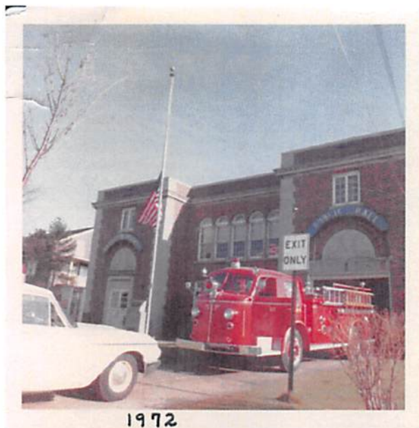
The Community Center 50 years ago!